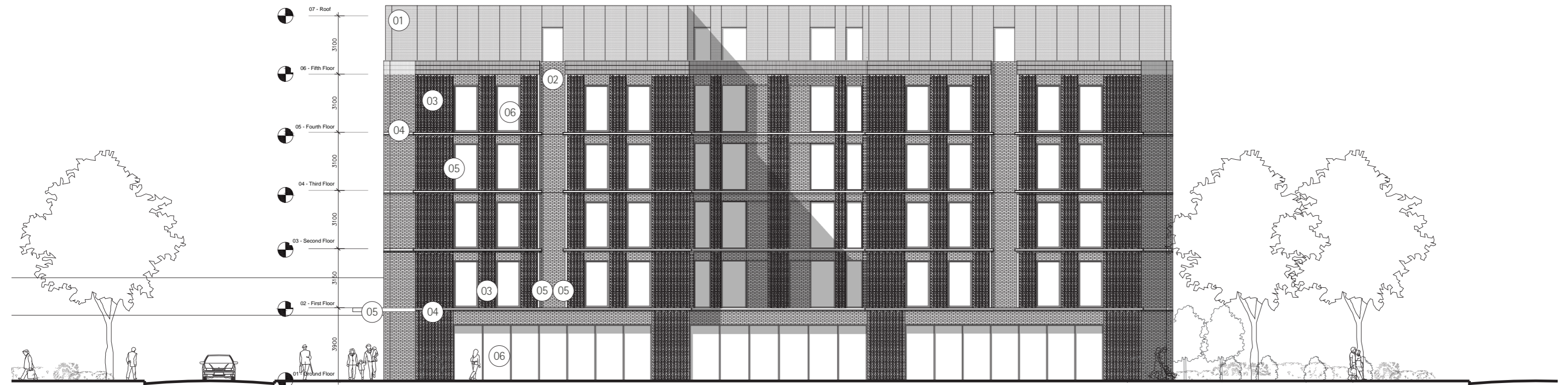
Scale 1:200 – South facing elevation detail