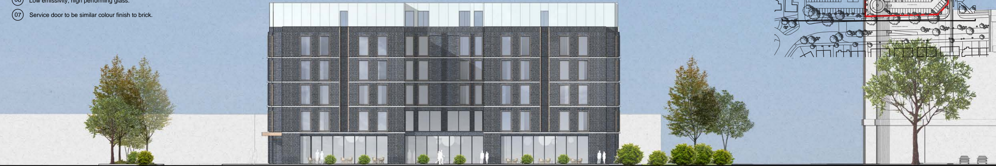
Site impression -South facing elevation